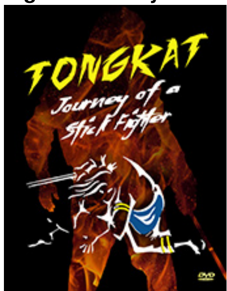
Tongkat NTSC (US Version) USD38.00 Tongkat PAL (UK/Europe Version) GBP25.00

Tongkat: Journey of a Stick Fighter is the 3rd installment in the Black Triangle Silat series of indie documentaries focusing on the Sumatran fighting system of Minangkabau Silek Harimau.