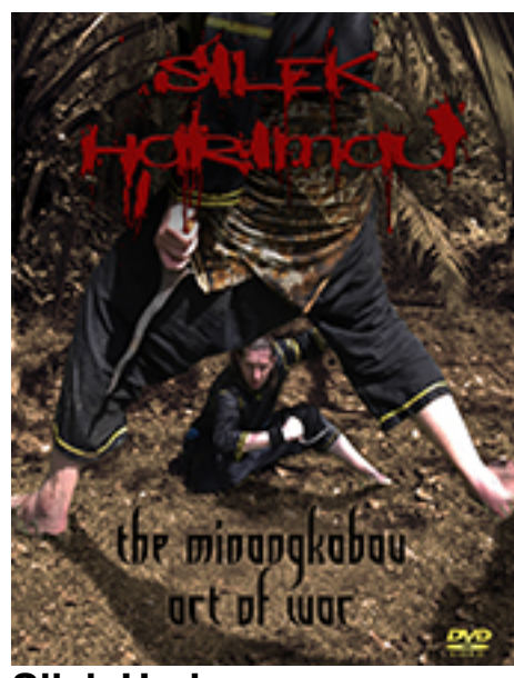
Silek Harimau NTSC (US Version) USD38.00 Silek Harimau PAL (UK/Europe Version) GBP25.00

Silek Harimau: The Minangkabau Art of War is a short indie demonstration film showcasing the martial art style that originated from West Sumatra.